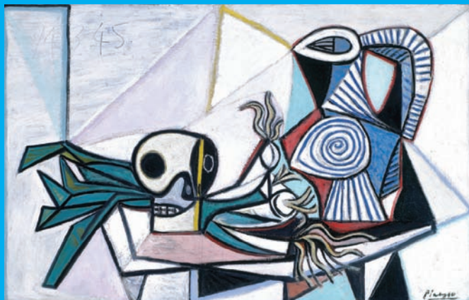
Pablo Picasso Still Life with Skull, Leeks and Pitcher 14 March 1945, © Succession Picasso/DACS 2009