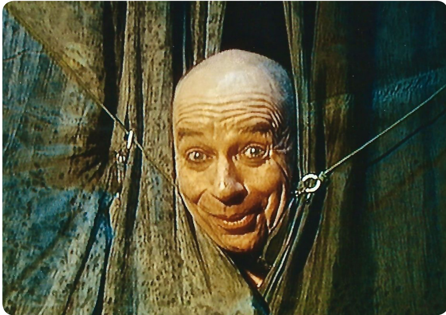
Theo Eshetu Travelling Light 1992, production still of Lindsay Kemp.